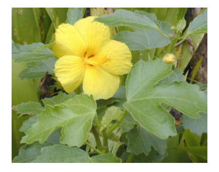
Yellow Hawaiian Hibiscus or Pua Moa Hau Hele

A simple tribute to all the people in Hawaii who have been affected by the fires.