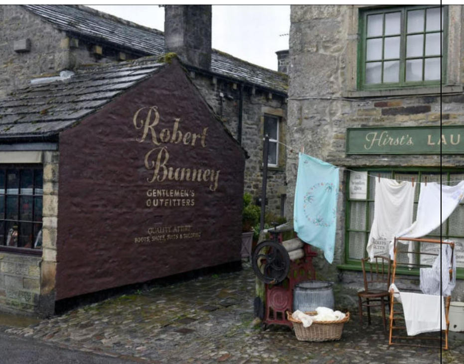
The ginnel transformed for the second series of the TV series "All Creatures Great and Small"