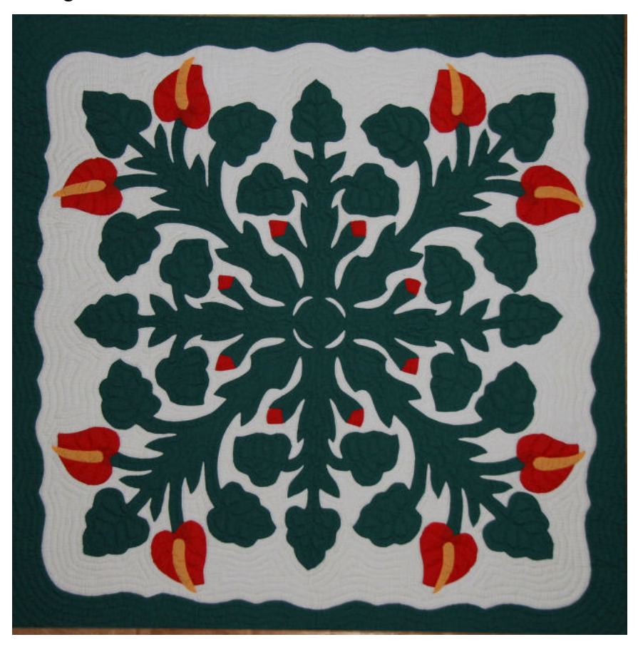
A Hawaiian quilt

Hawaiian quilt applique is made from a single cut on folded fabric. Quilting stitches normally follow the contours of the applique design.